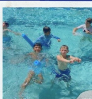
Ages 6 -12