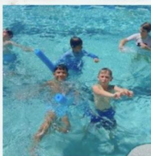
Ages 6 -12