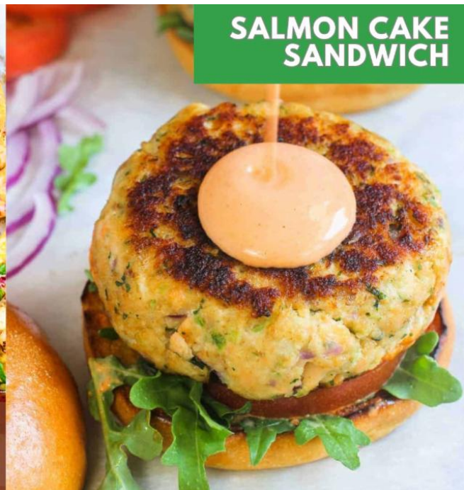
SALMON CAKE SANDWICH