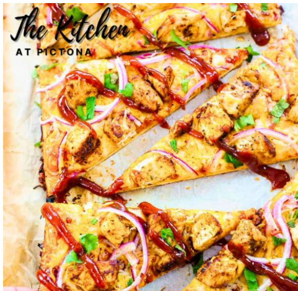
CHOICE OF CHICKEN OR SHRIMP FLATBREAD